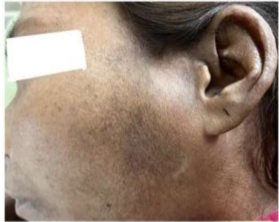
salt and pepper skin